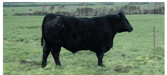
Raff Angus Certified Organic steers that were $738 per head more profitable.

The below information details where Raff Angus cull females sat when benchmarked against the NATIONAL COMPARISON for all females processed over the past twelve months sorted with an ossification >230, Grass Fed, no HGP.