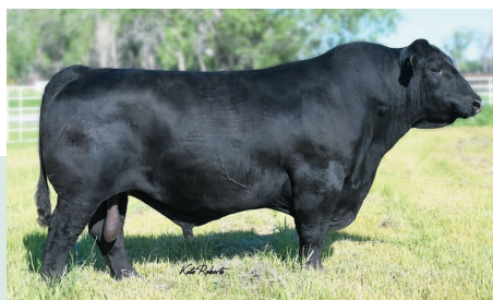
Jindra Megahit (USA)