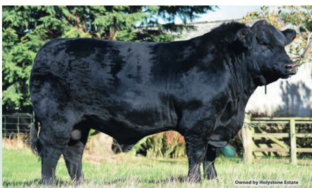
Gilbertines Powerhouse (UK)